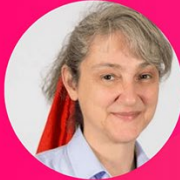
Prof Ayse Aysin Bilgin

CW International Statistical Institute Committee on Women in Statistics