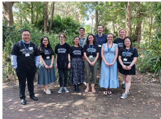
NSW Branch President with ASC23 Volunteers