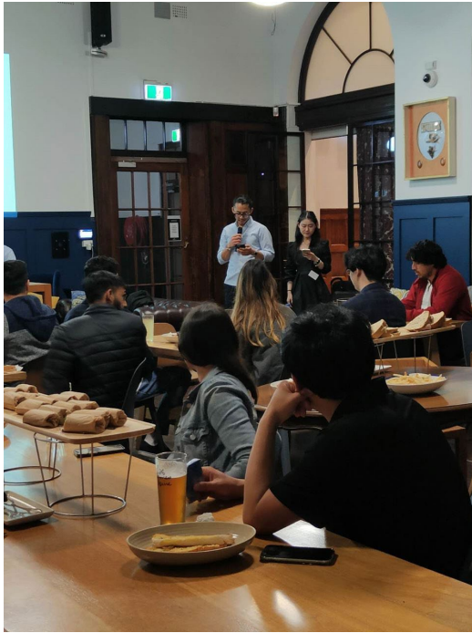
Early Career Event